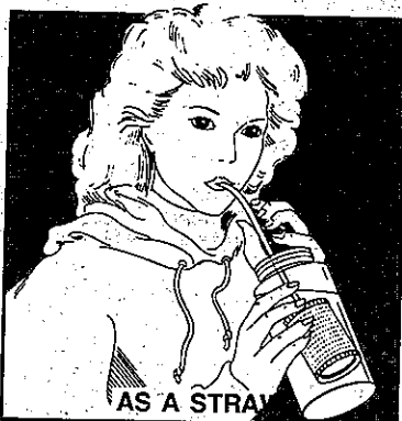
AS A STRAW

SELECTION OF WATER SOURCE The clearer the water source the closer you will come to the optimum performance and life of your filter.